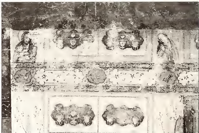
Figure 2. Detail. Jahangir and Prince Khurram Feasted by Nur Jahan . India, Mughal period, Jahangir period, ca. 1617. Opaque watercolor on paper, 25.2 x 14.2. Smithsonian Institution, Freer Gallery of Art, Gift of Charles Lang Freer, F07.258. Detail showing “Christian” images painted on a garden pavilion.